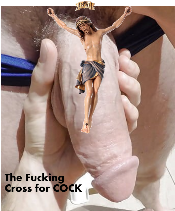
The Fucking Cross for COCK

SATAN'S FUCKING NAME IS TOO BIG FOR A STUPID FUCKING MASTURBATION SLAVE LIKE ME, I PRAY FOR HIS LUST AND FILTH ENERGY TO FLOW THROUGH MY COCK SHAFT. SO I CAN OFFER HIM MY CUM SACRIFICE, TO HIS BIG, BOLD, EVIL FUCKING SUPERIOR NAME. IT IS MY HONOR TO BE SATAN'S SLAVE.